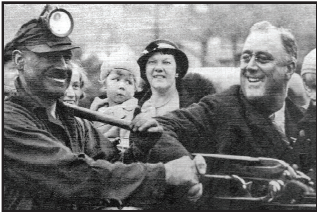
On the Campaign Trail

Franklin D. Roosevelt (Democrat) was re-elected for a second term defeating Alf Landon (Republican) and William Lemke (Union).