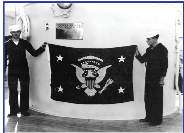
FDR goes to South America in November 1936 for his "Good Neighbor" cruise.

The world's major political leaders were: Australia, Prime Minister Joseph Lyons; Brazil, President Getulio Vargas; Canada, Prime Minister William Lyon Mackenzie King; Germany, Chancellor Adolf Hitler; Italy, Prime Minister Benito Mussolini; Japan, Prime Minister Keisuke Okada (till March 9) and Prime Minister Koki Hirota; Mexico, President Lazaro Cardenas; Russia/Soviet Union, General Secretary of the Central Committee Joseph Stalin.