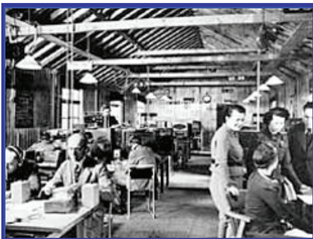
BBC News Monitoring Room

The BBC started the first public television broadcasts in London.