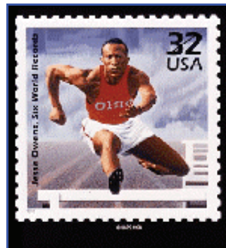
Olympic Star Jesse Owens

Wind . Billboard Magazine published the first pop music chart.